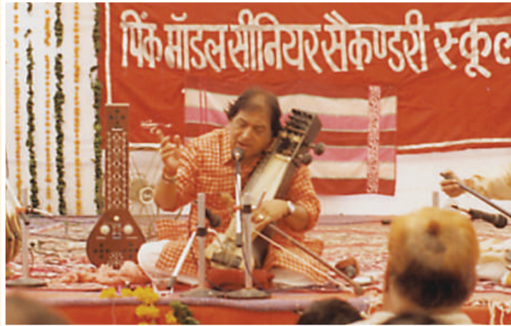
Famous Sarangi Player Ustd. Sultan Khan Performing