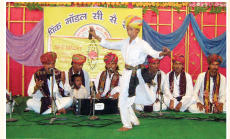
Famous Classical Singer Sh. Bundu Khan & Party Performing