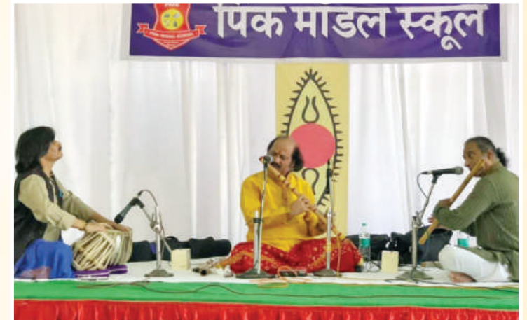
Famous Sarangi Player Ustd. Sultan Khan Performing